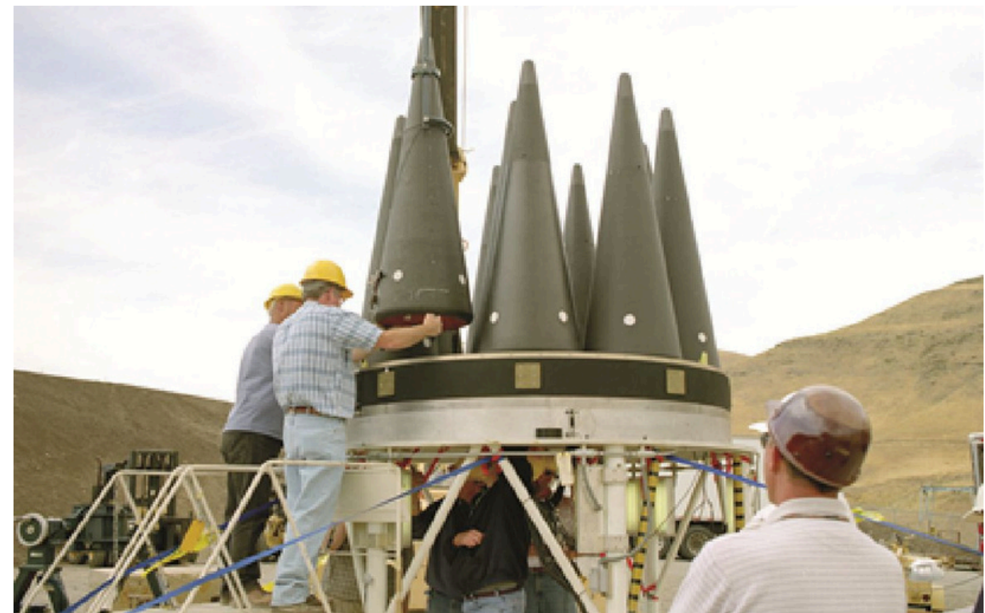
Image 1: Nuclear Warheads at Livermore Lab